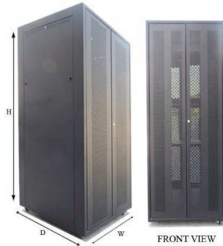
Tempered glass door or fully perforated door